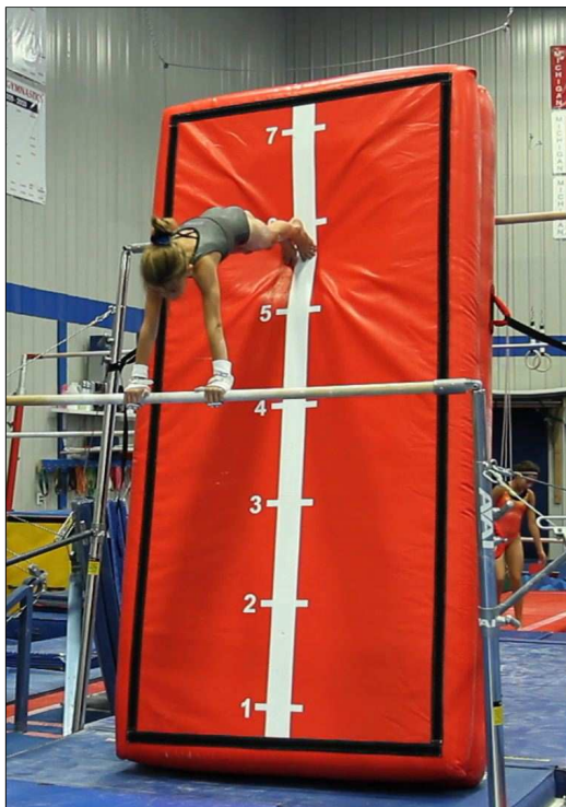
Bar Wall Station

Shown as multi-use system for bars, vault, tumbling or beam (This photo demonstrates a variety of uses for this product and is not intended to be used all at once as shown)