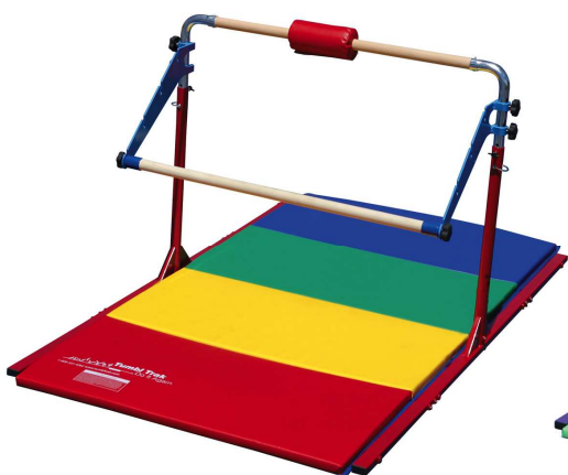
Shown on Jr. Kip Bar with Primary Rainbow Tumbling Mat & Bar Trainer Pad