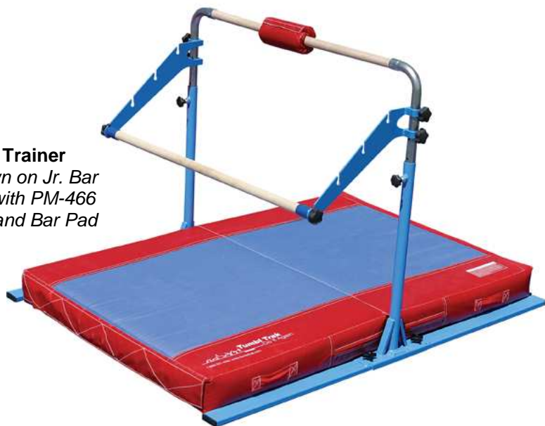
Cast Trainer shown on Jr. Bar Pro with PM-466 Mat and Bar Pad

The Cast Trainer is a set of brackets that attaches to Tumb Trak's Jr. Kip Bar and Jr. Bar Pro. It offers developing gymnasts a progressive approach to casting to a handstand and it can also function as a "Starter Bars" set for preschoolers.