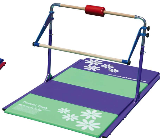
Shown on Jr. Kip Bar with Flower Power Mat & Bar Trainer Pad