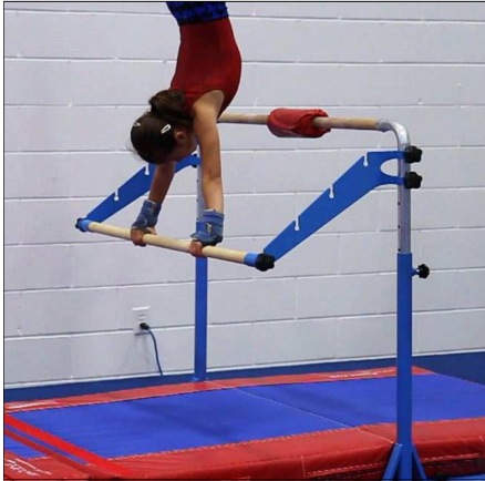
Beginner cast handstand

The Cast Trainer can be used in so many different ways, some of which are demonstrated in these photos. For more stations and information about the Cast Trainer go to www.tumbltrak.com/training .