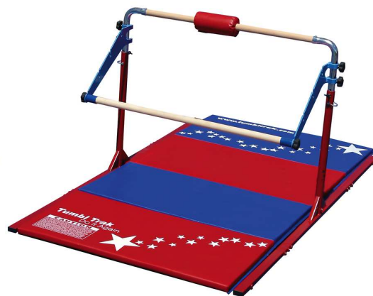
Shown on Jr. Kip Bar with Patriotic Mat & Bar Trainer Pad