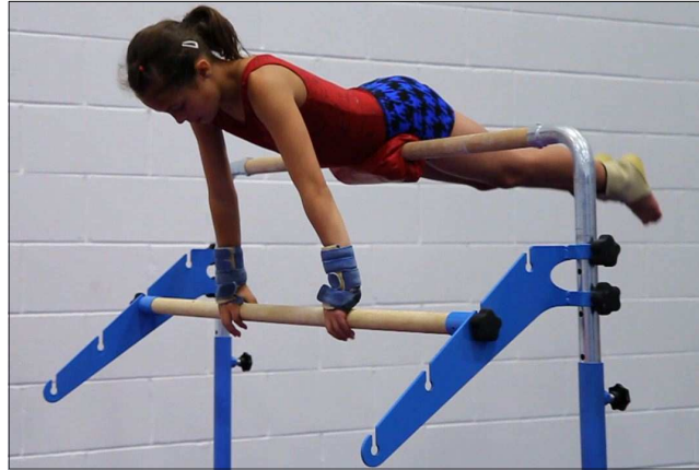
Advanced cast handstand